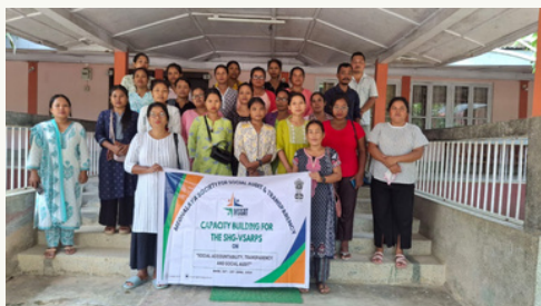
SHG of Ampati attending training