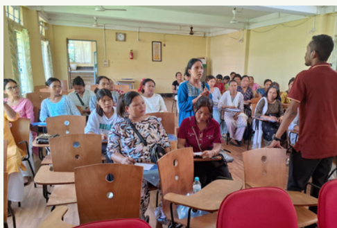
SHG of Williamnagar attending training