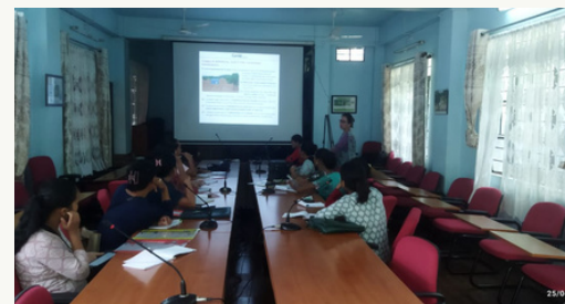
SHG of Mawkyrwat attending training