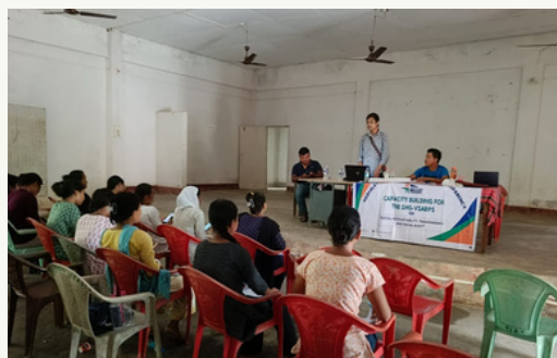
SHG of Selsella attending training