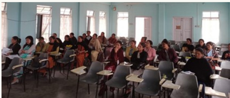
Social Audit Public Hearing for the ICDS in Mairang C&RD Block, EWKHD, Meghalaya, 10th April 2024.