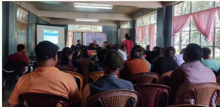
Social Audit Public Hearing for the PM POSHAN Shakti Nirman in Nongstoin C&RD Block, WKHD, Meghalaya, 26th April 2024.