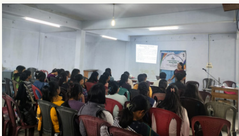
SHG of Mawkyrwat attending training