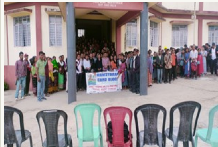
Social Audit Public Hearing for MGNREGA, PMAY-G, NSAP in Mawsynram C&RD Block, EKHD, Meghalaya, 22nd April 2024.