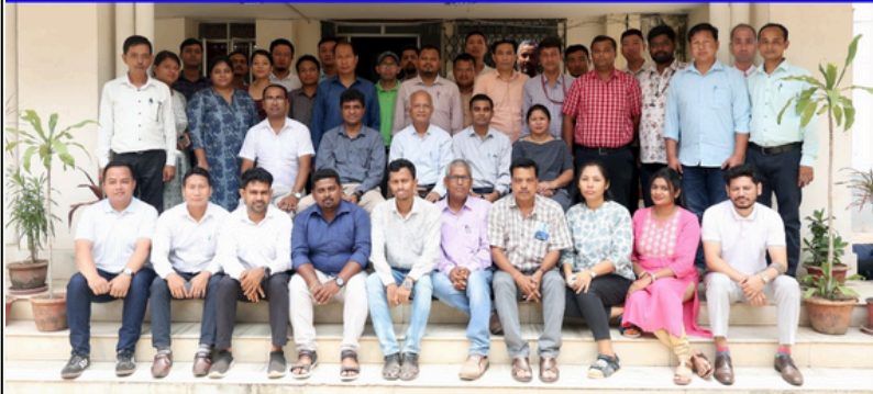
Organized by SAU - Tripura In association with NATIONAL INSTITUTE OF RURAL DEVELOPMENT AND PANCHAYATI RAJ Rajendranagar, Hyderabad -500030