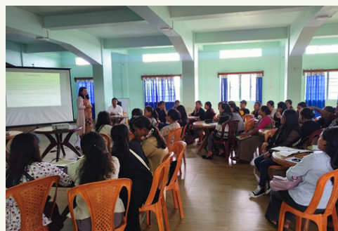
SHG of West Jaintia Hills attending training