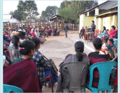
Social Audit Meeting /Gram Sabha at the Village level