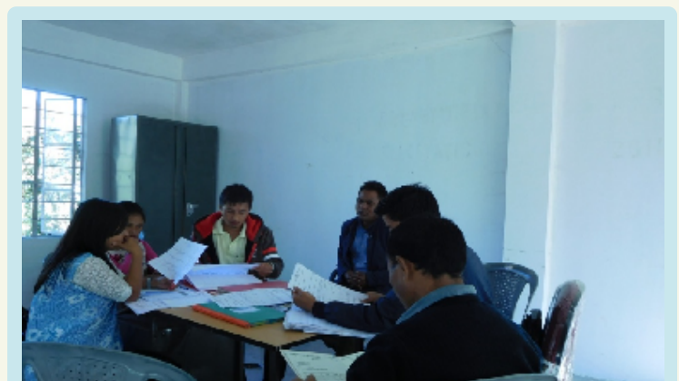
Collation and Consolidation of Records & information