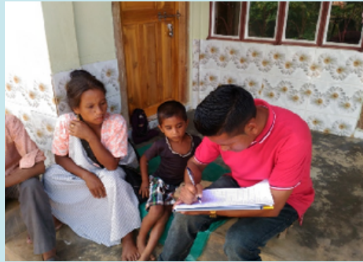
Door to Door Verification