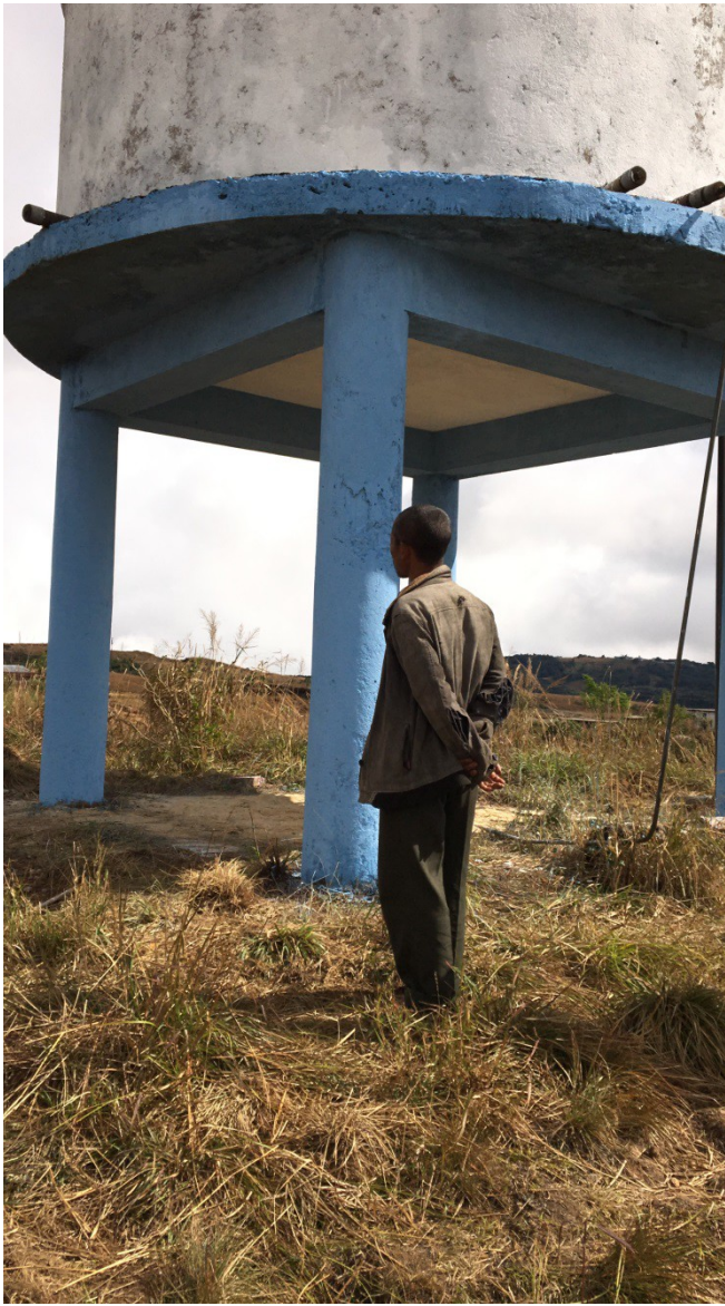
Public Health Engineering